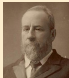
National Library of Australia, an23379300

Samuel Griffith became the first chief justice of the High Court of Australia.