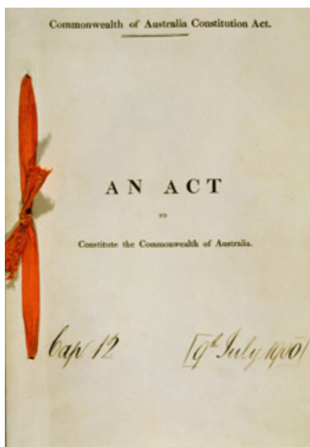
Commonwealth of Australia Constitution Act, 1900: Original Public Record Copy (1900)

The Constitution states that federal elections must be called at least every three years. It also ensures senators and members of the House of Representatives are directly chosen by the people.