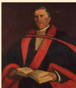
Portia Geach, National Library of Australia, an2241658

Alfred Deakin was part of the constitutional delegation to London and became the second Prime Minister of Australia (Protectionist Party) 1903–1904.