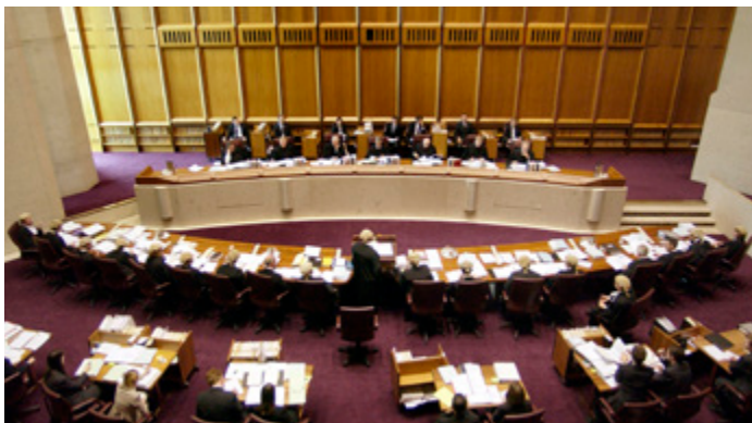
The High Court of Australia

It is the principal function of the High Court of Australia to interpret the Constitution and to settle disputes about its meaning