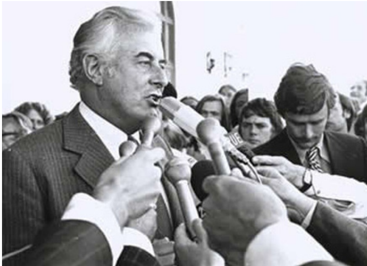
Australian Information Service, National Library of Australia, an 24355082

On 11 November 1975 the Governor-General, Sir John Kerr, dismissed Gough Whitlam as Prime Minister and appointed Malcolm Fraser as a caretaker Prime Minister. This occurred because a number of events resulted in the refusal by the Senate to pass the government's budget bills in October 1975.