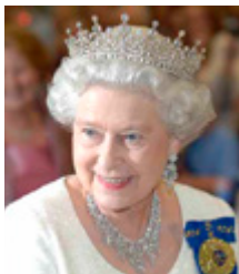
Her Majesty Queen Elizabeth II

The Commonwealth of Australia Constitution Act 1900 (the Act) granted permission to the six Australian colonies, which were still subject to British law, to form their own Commonwealth government in accordance with the Constitution. The Act consists of a preamble and nine clauses, of which clause 9 is the original Australian Constitution. The Constitution consists of eight chapters and 128 sections.