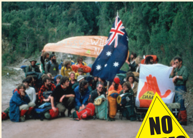
Protesters at Franklin Dam site 1982

National Archives of Australia: A6135, K1512/83/4 Photo credit: Tasmanian Wilderness Society