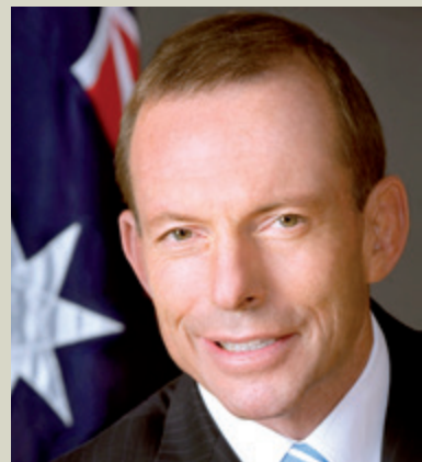
The Hon Tony Abbott MP, Prime Minister

The Constitution does not mention the Prime Minister or the Cabinet, both of which are central to the working of government and the Parliament.