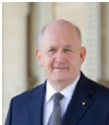
His Excellency General the Honourable Sir Peter Cosgrove AK MC (Retd).

Chapter 2 describes the power of the most formal elements of Executive Government, including the Queen, Governor-General and the Federal Executive Council.